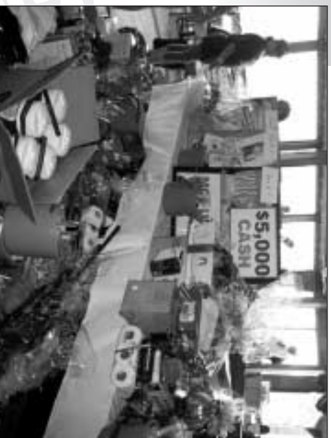
PRIZES FOR EVERYONE