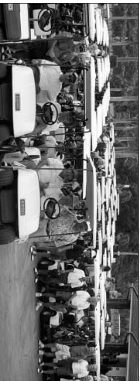
Golfers, Man Your Carts!