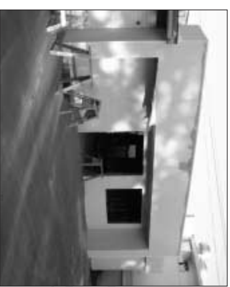
Kitchen Entrée - Isenberg Street