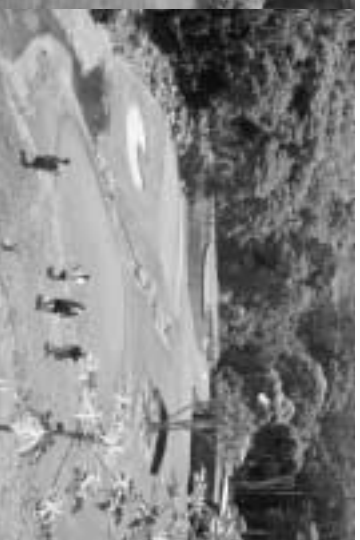
Waihole Country Club