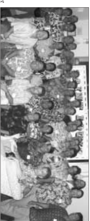
25th Reunion Banquet