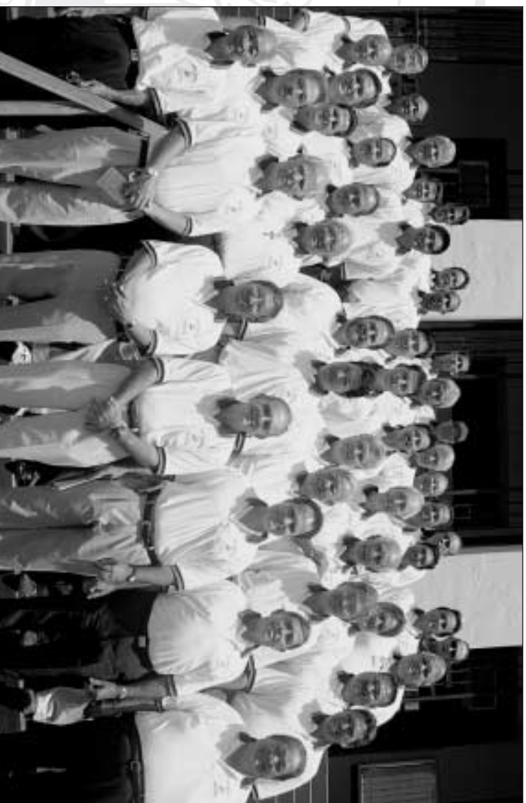
Career Day 2004