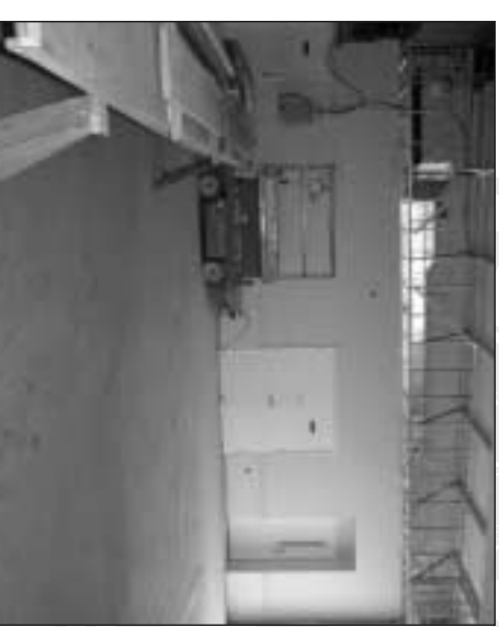
Banquet Hall - Looking to East to Coolidge Street