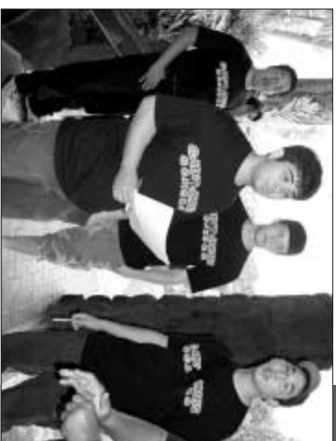
Waiting for Assignments