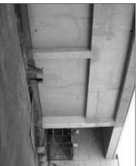
Mauka Entrance - Opposite First Hawaiian Bank