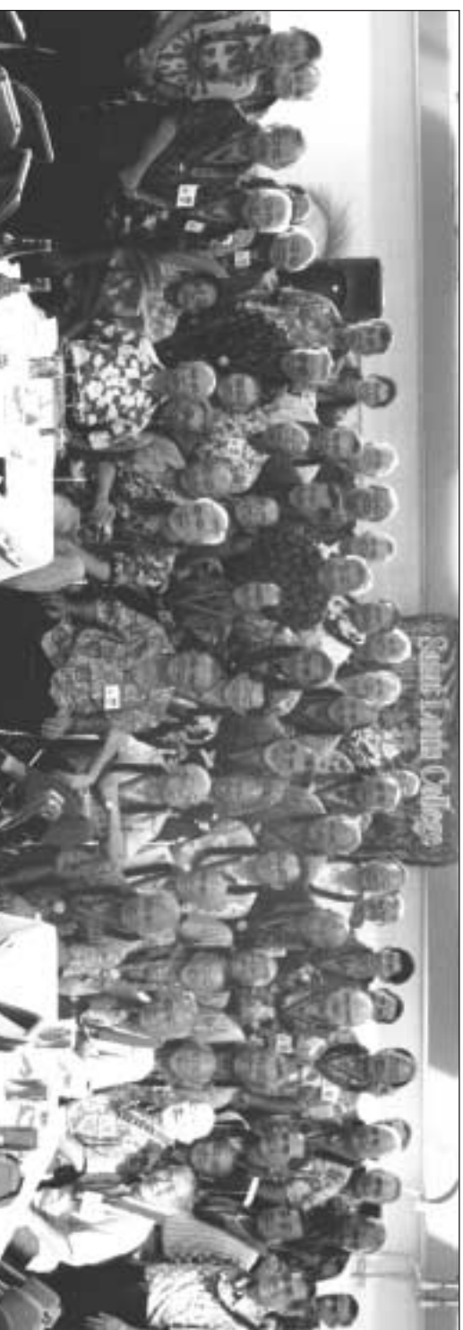
Class of 1954 at Luau