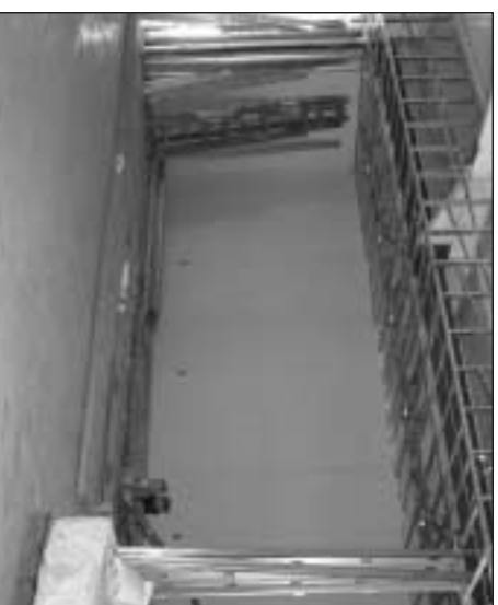
Stage Area - Banquet Hall