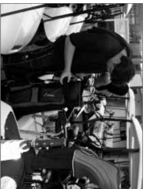
Loading Bags onto the Carts