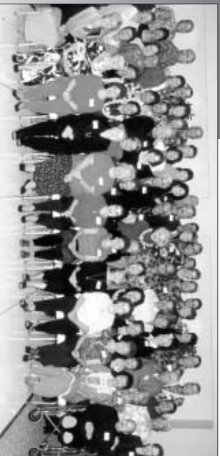
All Hawaii Class of 1958 Group - Valentine's Day 2004 - Golden Nugget Hotel, Las Vegas