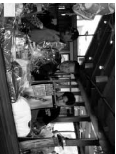
Setting up the prize table